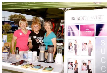
Good healthy stuff at the Body-Wise Booth