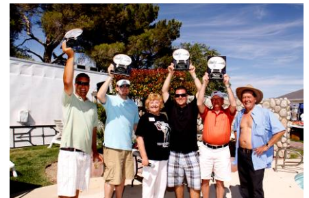
The winning team shows off their plaques