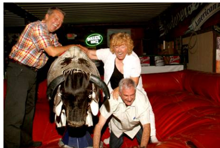
The hardest part is mounting one of the bulls

Lots of fun can be had at Dylan's Roadhouse on Boulder Highway. Featuring live bands, pool tournaments, line dancing, dance lessons, drink specials and, of course, Mechanical Bull Riding. Members and guests of the Sin City Chamber took advantage of this fun at the June 3 rd mixer.