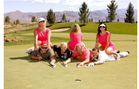
Fun in the sun with the ladies from the Ranch